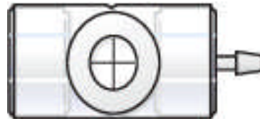
ThermoFlo™ Trach CRV O 2 Integral Adapter for Supplemental O 2